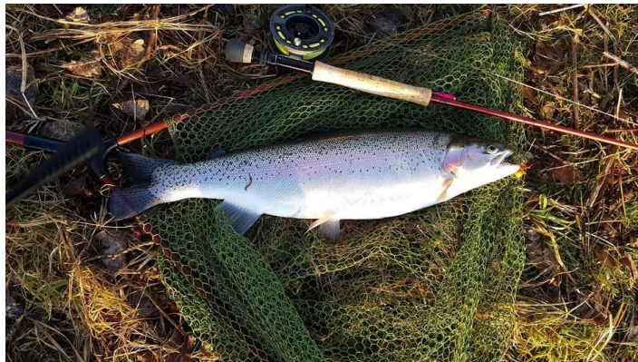
Greg Bates – 5lb 01oz